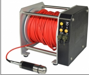
Integrated motorized reel including the 52Hz probe with 60 m cable; battery and control panel. Mod. 58-E4600/E1.