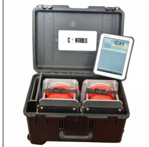
Complete set, easily transportable with the very small wheeled suitcase. Mod. 58-E4600/E.