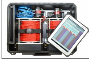
Complete set, easily transportable with the very small wheeled suitcase. Mod. 58-E4600/E.