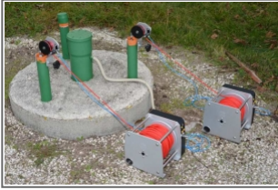
Complete Cross-Hole system with 2 motorized reels, on site application. Mod 58-E4600/E