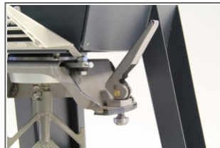
65-L0512 - Detail of the quick bowl mounting device