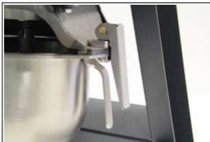
65-L0512 - Detail of the quick bowl mounting device