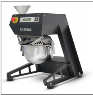
Automatic programmable mortar mixer model 65-L0512 standard fitted with stainless steel bowl, EN beater and open-type sand hopper