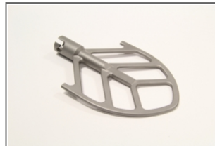
Stainless steel beater conforming to EN 196-1, model 65-L0512/EN