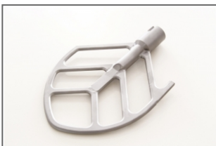
Stainless steel beater conforming to ASTM C305, model 65-L0512/AS